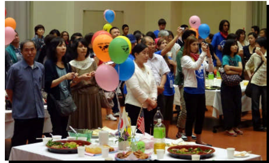
Fri. June 8 th at HIFA Welcome Party in Harima-chō