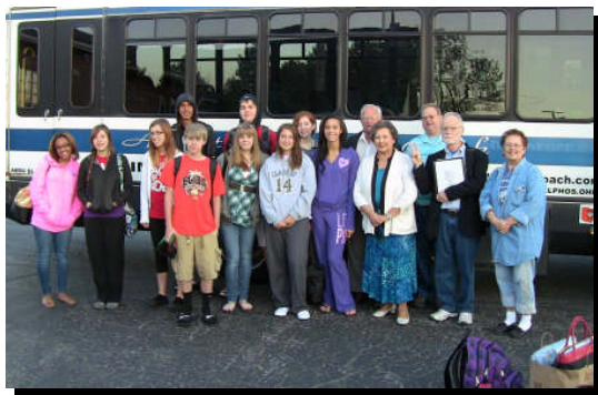
Wed. June 6 th at New Creation Lutheran Church